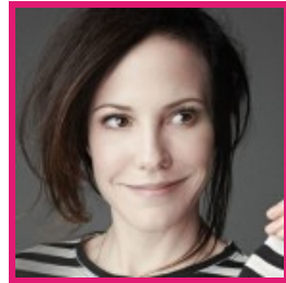
Mary-Louise Finally Addresses Billy Crudup Leaving Her For Danes