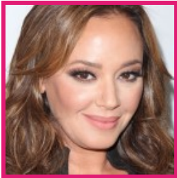
Leah Remini's Surprising Claims About Suri Cruise