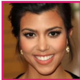
Scott Disick Overshares Photo of Kourtney On Instagram