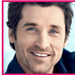
10 Ignorant Actors Who Got Kicked Off Their Own Shows