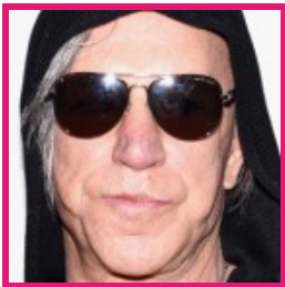
12 Washed-Up Actors Trying to Climb Their Way Back to the Top